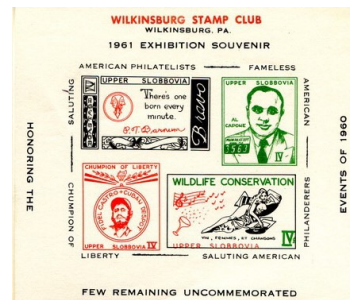
#2 Variety of the 1961 SS