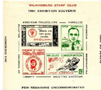
#3 variety of 1961 SS